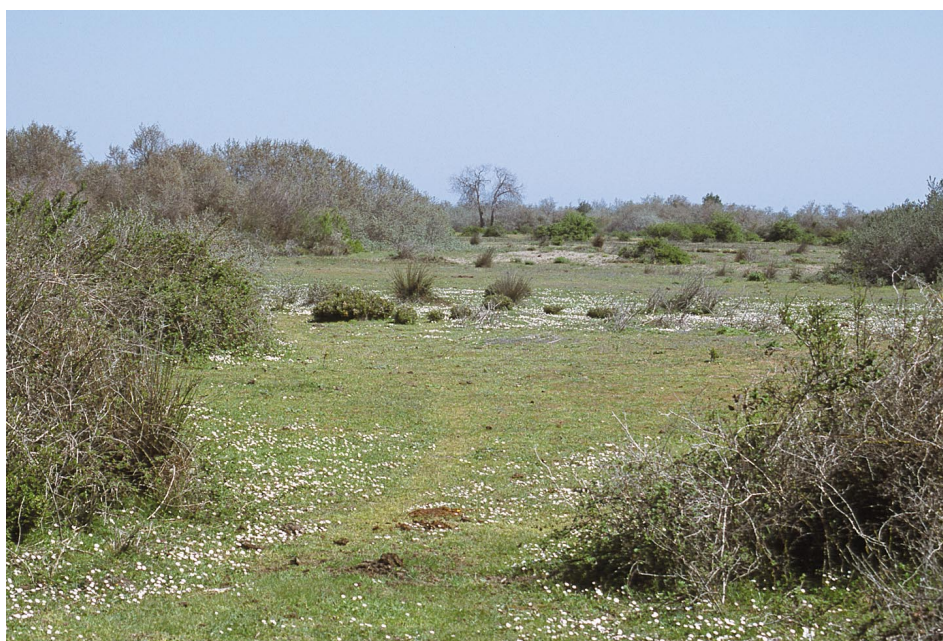
Fig. 3. Dunes and shrubs on the spit which separates Lake Cernek from the Black Sea