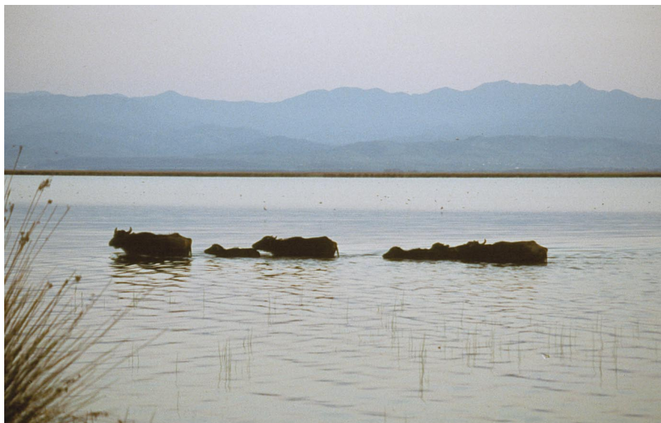
Fig. 2. Lake Cernek and Pontine Mountains - local geographical barriers